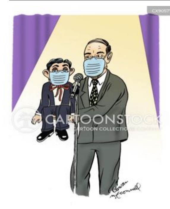
Lousy Ventriloquist Fears Return to Normal