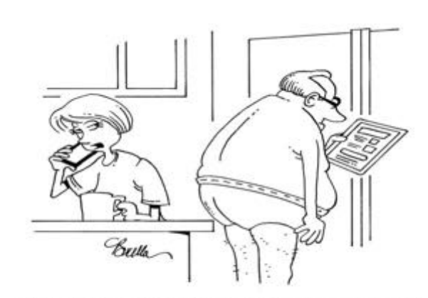
"I don't mind him working from home, except for Casual Fridays."