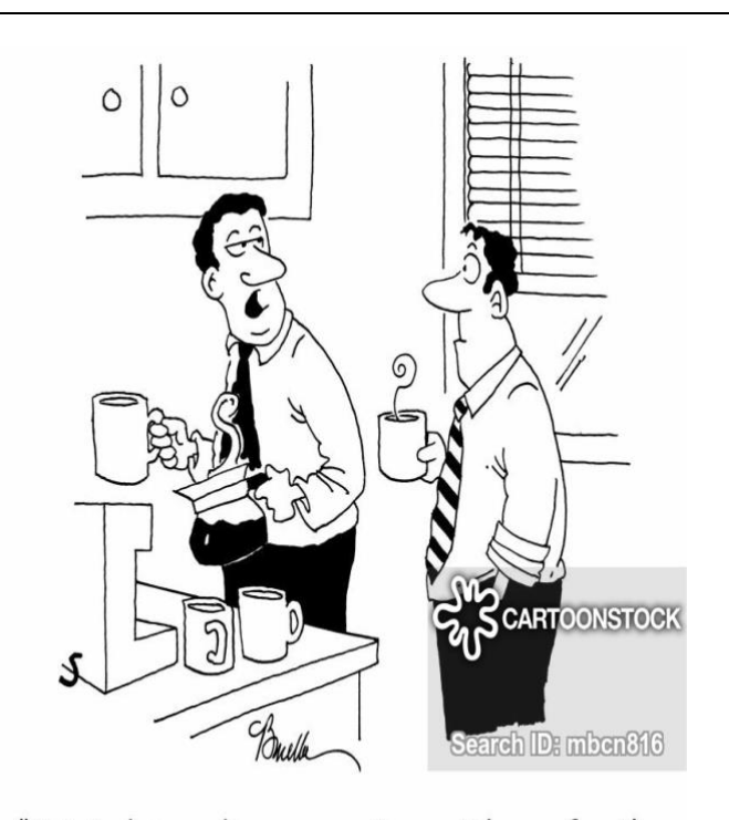
"I tried spending more time with my family, but they all couldn't fit in the golf cart."