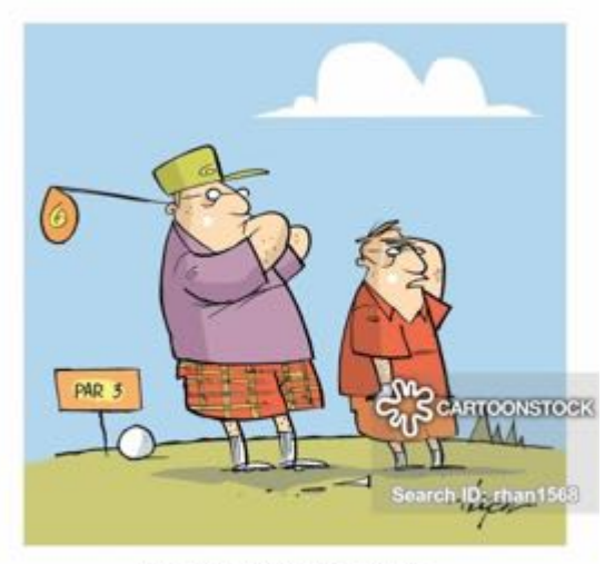
IT'S OK, I THINK HE'S MOVING.

This year the Club Championship was played in the purest form of golf - 4 rounds of stroke. It's inevitable that there will be a blow out at some stage to the point that only ten players in the Club finished all four rounds! Others have to remember that anything can happen in golf and no matter what the score, you should always finish the competition unless of course you are injured. We all have bad scores at some stage but