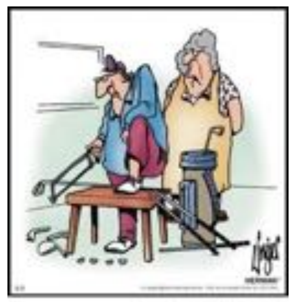
"Did you win?"

This is always a good night, where we not only celebrate our winning golfers, but we also find out just who are our champion trivia kings/queens. Competition is fierce for the trivia prize so pick your partners wisely, so that if you don't take home a golfing prize for the year you can always take home the trivia title.