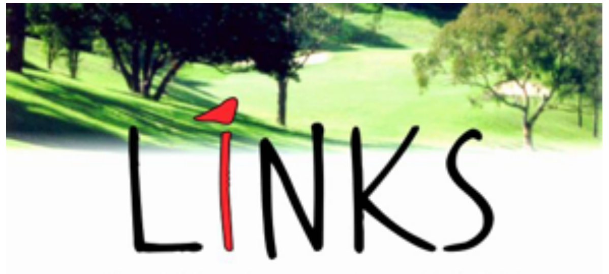
Newsletter of the Lane Cove Golf Club For the information of members and their guests