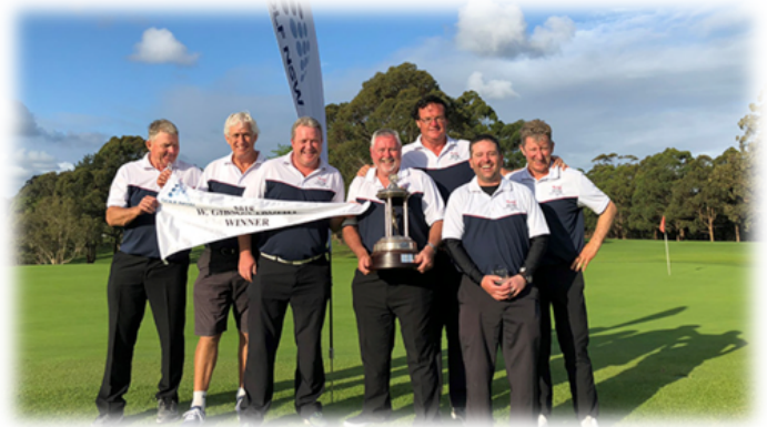
2018 Gibson Trophy winners, the Coast GC