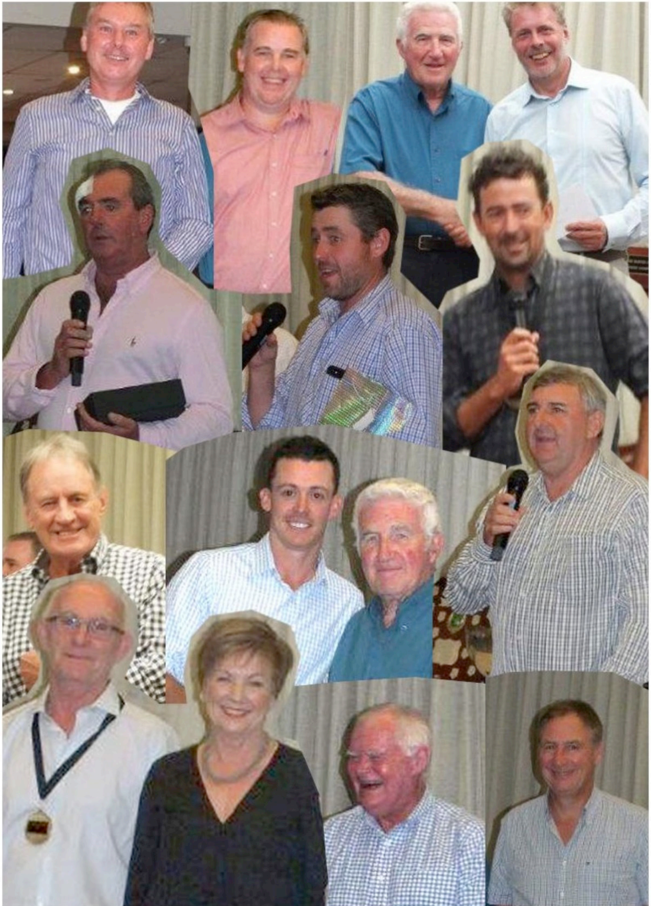
Winners are grinners! Men's Golf Presentation night. 11 March, 2017.